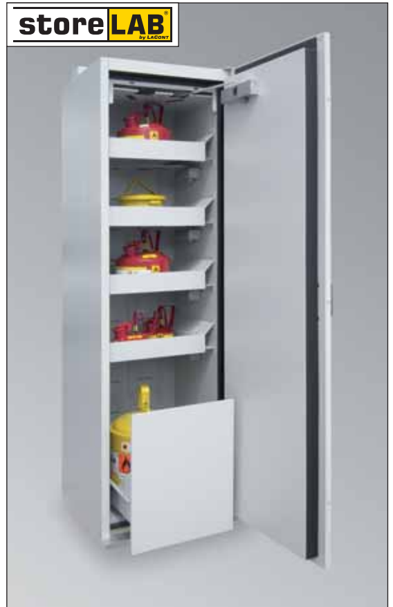
SiS Type 90 / 600 VS4-ES, Art. No. B80-2588-B, RAL 7035, incl. 4 pull-out shelves and 1 disposal compartment