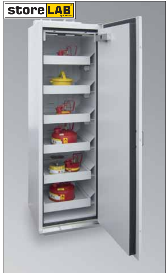
SIS Typ 90 / 600 VS6, Article No. B80-2570-B, RAL 7035, incl. 6 pull-out shelves